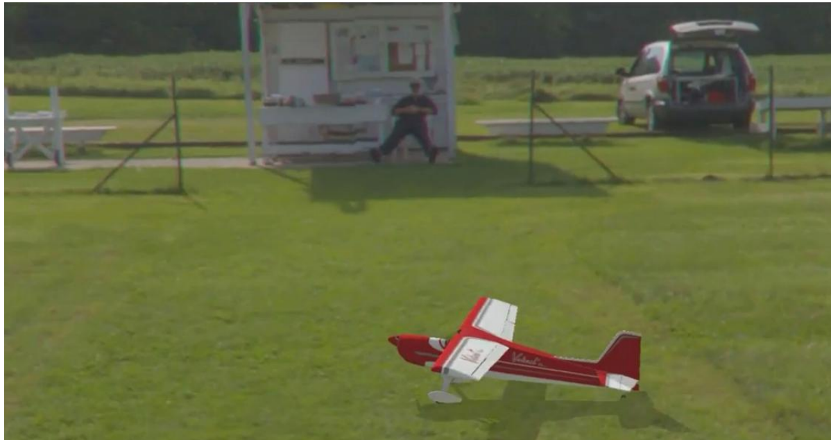
Photo from Virtual Club Fly-in on Real Flight (Rike Field photofield) held on 1/31

You can download the club field via the following link. Thanks to Robert Gough for generating it!